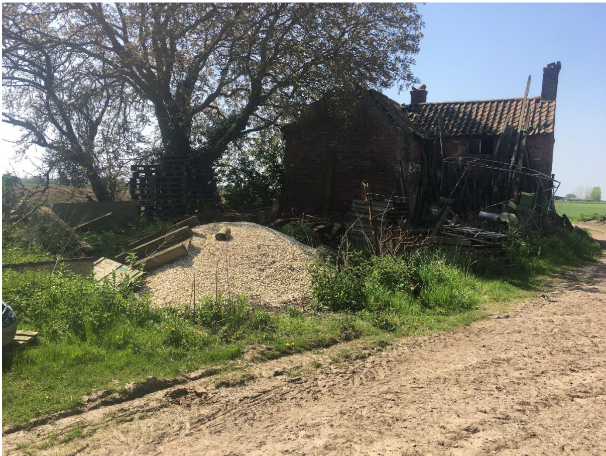
Derelict farm near Brothertoft – such semi-ruins are frequent in Fenland and a source of plants that establish in the agricultural landscape

Garden escapes may become established weeds in time. Fenland has very few records for any hawkweeds ( Hieracium species) but the rather ornamental Dappled Hawkweed ( H. scotostictum ) was found on verges near houses in Gedney in 2018, following on from Lewis Saunders first vc 53 record in a garden centre at Spalding in 2014. The decorative Blue Eryngo ( Eryngium planum ) has a number of grass verge records in Fenland, mainly in Cambridgeshire (Ely, Soham, Witcham etc). In 2018, a further site was added by Alex Scott at Sutton and by Owen near the power station in Spalding. A purple form of the Garden Orache ( Atriplex hortensis ), possibly the form “Crimson Plume”, has escaped onto a roadside near Ten Mile Bank and has now survived for at least 5 years. Another distinctive Chenopodiacean , the Tree Spinach ( Chenopodium giganteum ) was an escape that Jonathan Shanklin confirmed from a CFG trip at Chatteris in October. Plants with its distinctive leaf shape with purple bases are seen in the gateways of some beet and potato fields in Fenland; this escape may prove to be commoner than presently believed (it has just seven confirmed sites in the counties that overlap Fenland, with just the Chatteris site actually in Fenland).