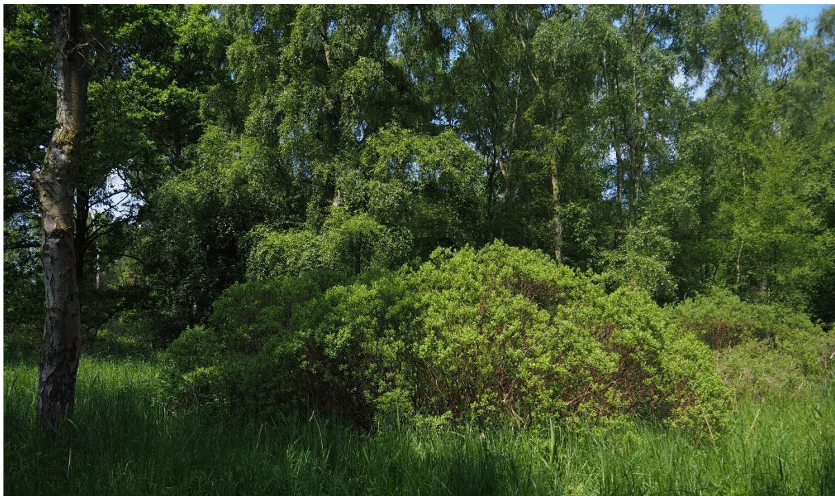
Clump of Sweet Gale ( Myrica gale) at Woodwalton Fen NNR