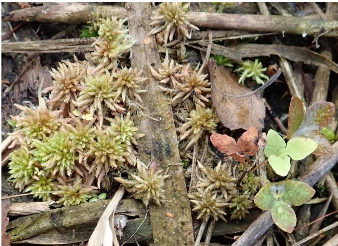
Sphagnum subnitens with Osmunda sporling, Holme Fen