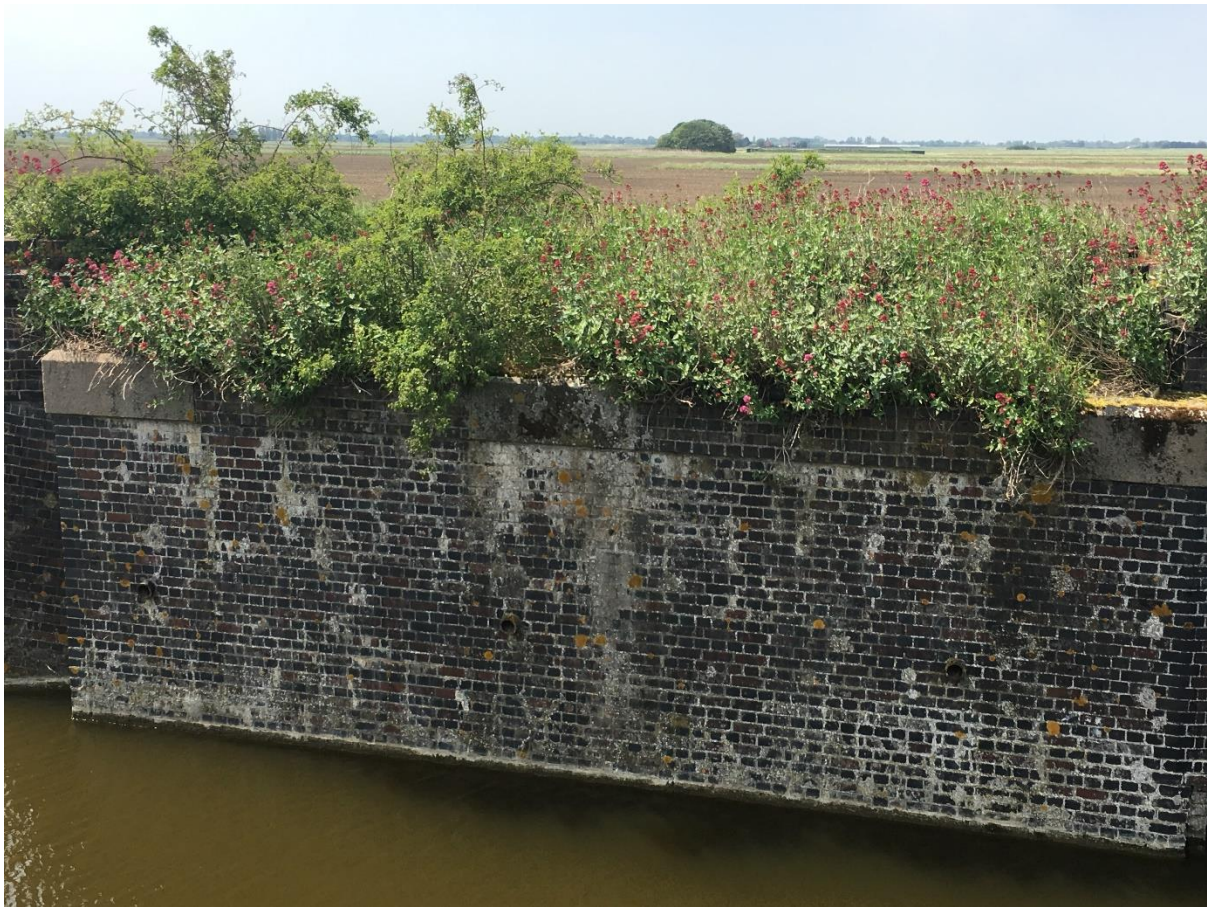
Red Valerian ( Centranthus ruber ) well established on an old railway bridge by the Hobhole Drain at Midville

Occasionally Fenland droves have unexpected native species or archaeophytes well away from their usual habitats. Thus Marjoram ( Origanum vulgare ) grew in Fodder Fen, Prickwillow, though possibly of garden origin from a derelict bungalow there. Catmint ( Nepeta cataria ) is an archaeophyte of the chalk but is scattered along drove-sides and spoil heaps in the black fen of Queen's Ground and near the River Lark. Henbane ( Hyoscyamus niger ) is another archaeophyte of the chalk that also occurs in sandy places. It is decidedly uncommon in Fenland but was found in 2018 by the CFG at Walpole Marsh.