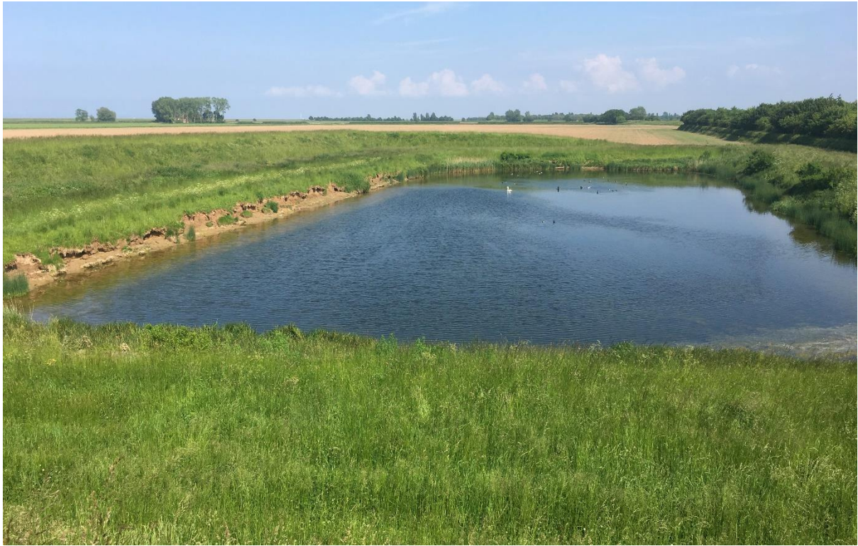
New aquatic and grassland habitats – irrigation reservoir or wildfowl pit near RAF Holbeach