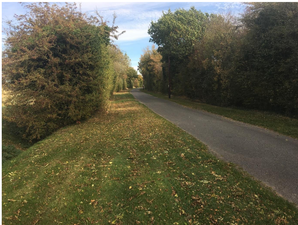
Ferry Lane between North & South Kyme – old grass verges and hedges with Dog's Mercury ( Mercurialis perennis )

Most of the habitats dominated by woody plants in Fenland are planted – hedges, shelter-belts, orchards and plantations. Although most woodlands in Fenland were planted over the past century, very locally they are of older origin and support some ancient woodland indicators, such as Dog's Mercury and Wood Speedwell ( Veronica montana ). For example, near the Kymes in Lincolnshire, there are fragments such as Ferry Wood and Old Wood with a scattering of old woodland species. In 2018, we found Small Teasel ( Dipsacus pilosus ) in this area, a species which is otherwise mainly found at the Fenland edge e.g. by the Holme Brook. Other small woodlands and shrubberies may be dominated by willows and can be derived from planted holts or develop through succession. Salix is a complex genus in Fenland with many hybrids frequent, sometimes introduced specifically as osiers whilst others have probably occurred naturally: S. x calodendron , S. x holosericea , S. x reichardtii and S. x smithiana . S. x fruticosa is the hybrid between Osier ( S. viminalis ) and Eared Sallow ( S. aurita ) and, despite the absence of the latter parent over much of Fenland, this shrub now turns up on ditch banks and carr, possibly due to its use in biomass production. Older willows are an important habitat for epiphytes, both Bryophyta and vascular plants – for instance, Alan Leslie found both Polypodium vulgare and P. interjectum on Crack Willow by the Commissioners' Pit near Upware.