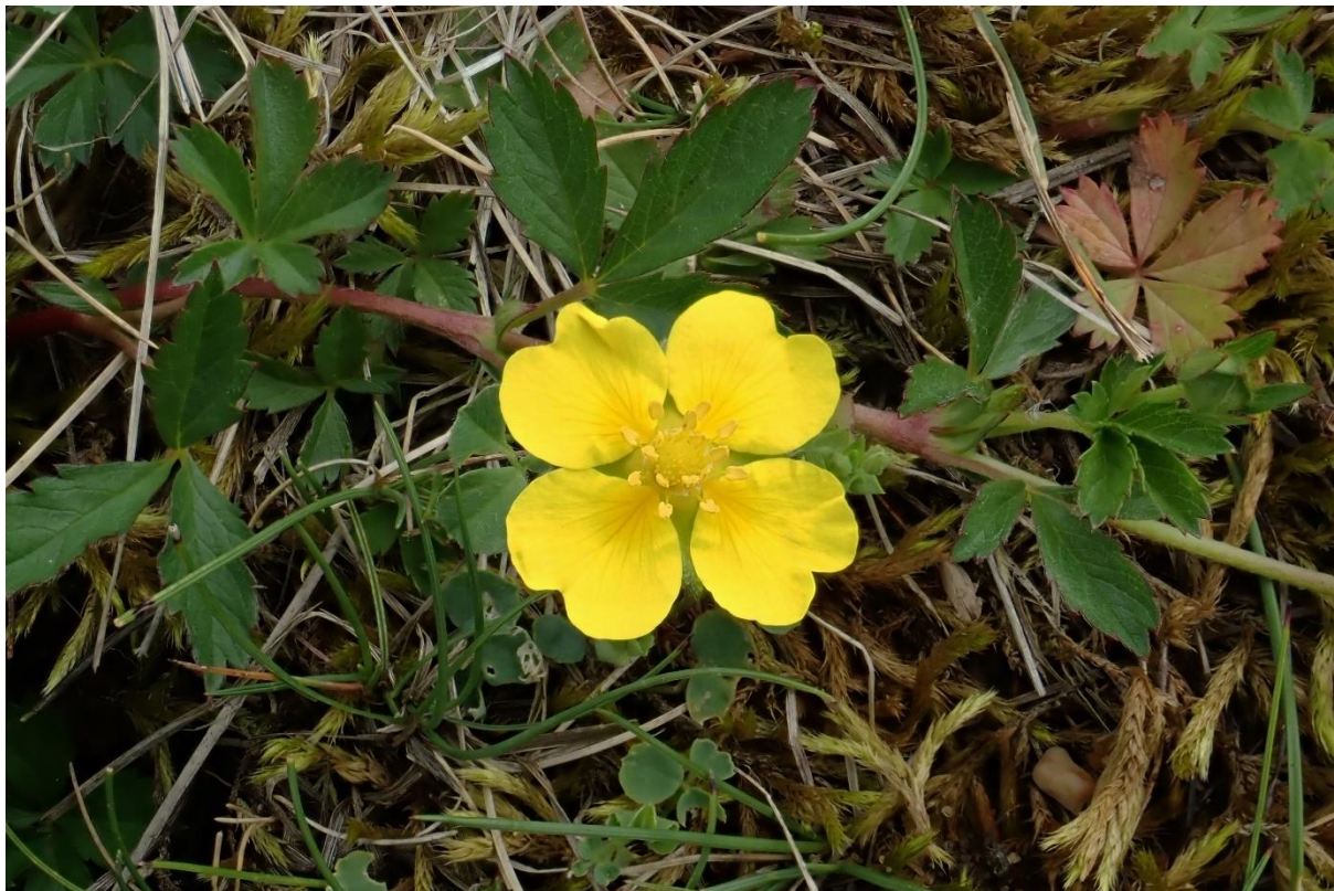
Hybrid Cinquefoil ( Potentilla x mixta ) on Wimblington Common

Drainage channel banks can also be important for dry grassland plants and for species of open ground, especially where mowing suppresses bramble and tall grasses. Field Pepperwort ( Lepidium campestre ) is local though widespread in such sites in Fenland, with good stands recorded in 2018 near Stainfield (close to Bardney) and along the Sixteen Foot Drain near Wimblington. At the latter site, Jonathan Shanklin found Keeled-fruited Cornsalad ( Valerianella carinata ), an annual with very few Fenland sites.