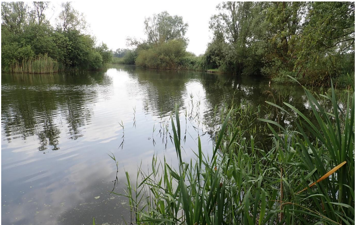
Long-established wetland and carr habitats - Wimblington Common © Jonathan Graham (2018)