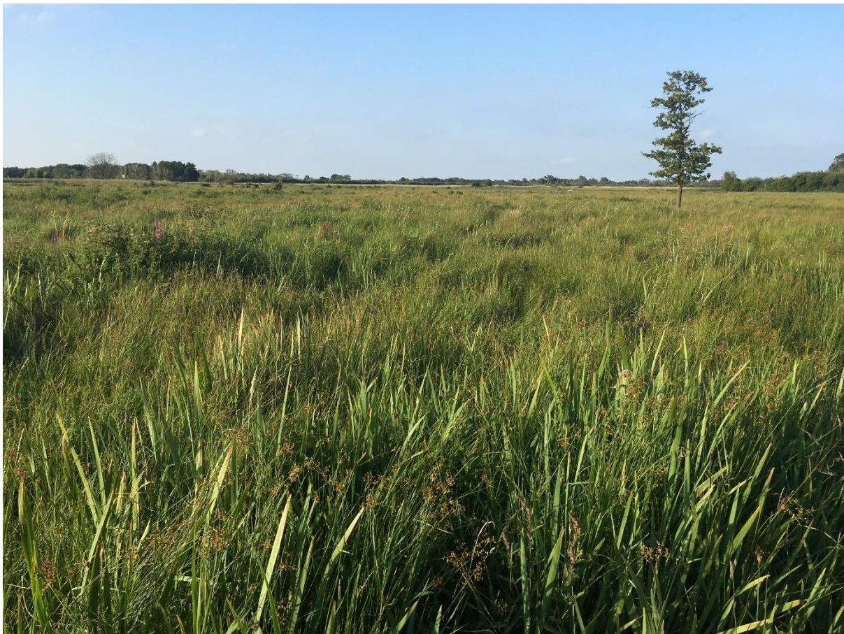
Verrall's Fen, Wicken Fen NNR – horse-grazed semi-natural fen