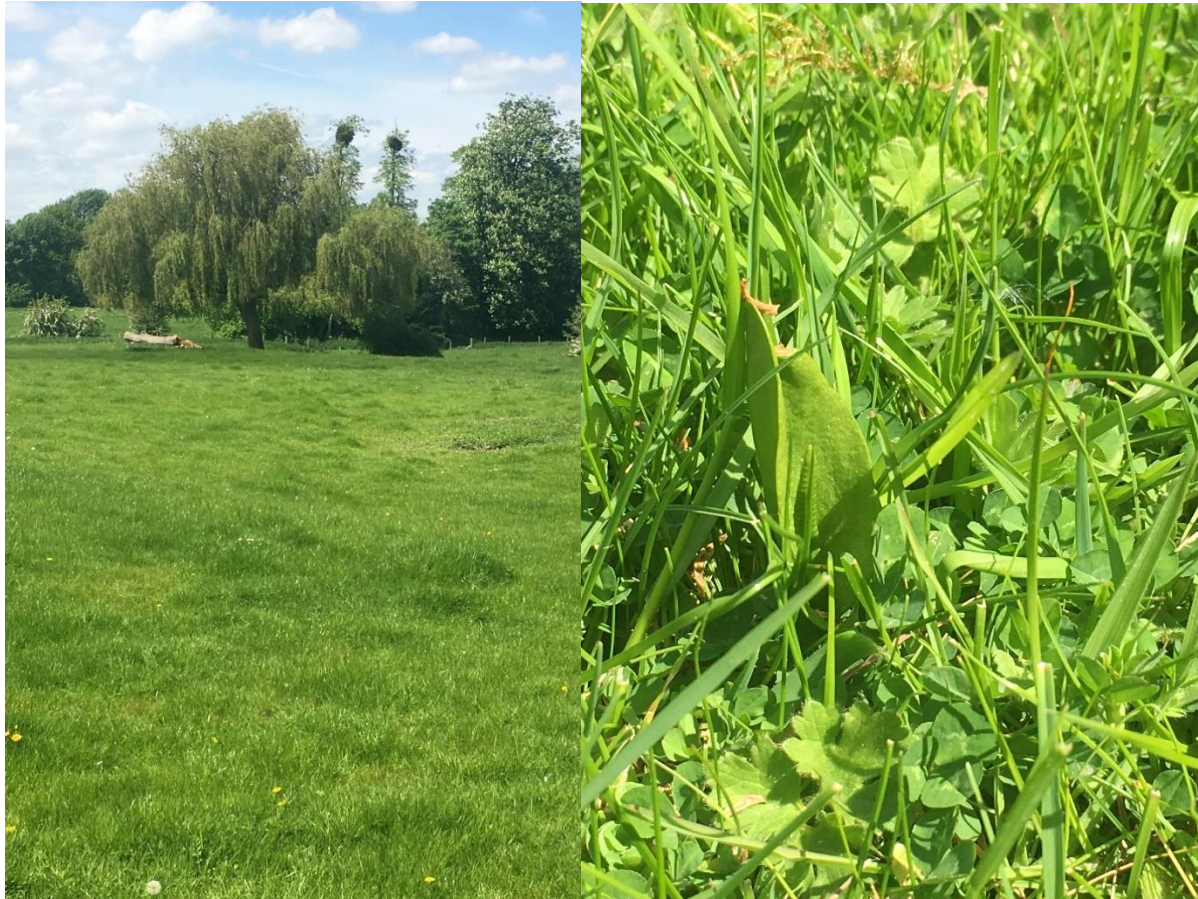
Old pasture at Abbey Fields, Thorney with Ophioglossum vulgatum – note also the Mistletoe ( Viscum album ) on old trees around the grassland

CFG and we have made detailed surveys e.g. finding Meadow Saxifrage ( Saxifraga granulata ) at Moor Closes and outlying sites for the Green-winged Orchid ( Anacamptis morio ) in 2018. A less well-known area of old grassland is the Abbey Fields at Thorney which we visited with Rex Sly in May, where the grasses of old pasture were accompanied by much Galium verum , Ranunculus bulbosus and, best of all, patches of Adder's-tongue Fern ( Ophioglossum vulgatum ).