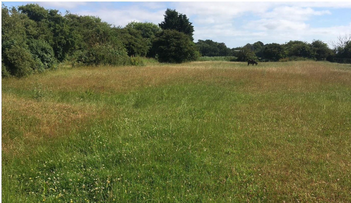
Fenland history – grassland on earthworks of Wainfleet old town