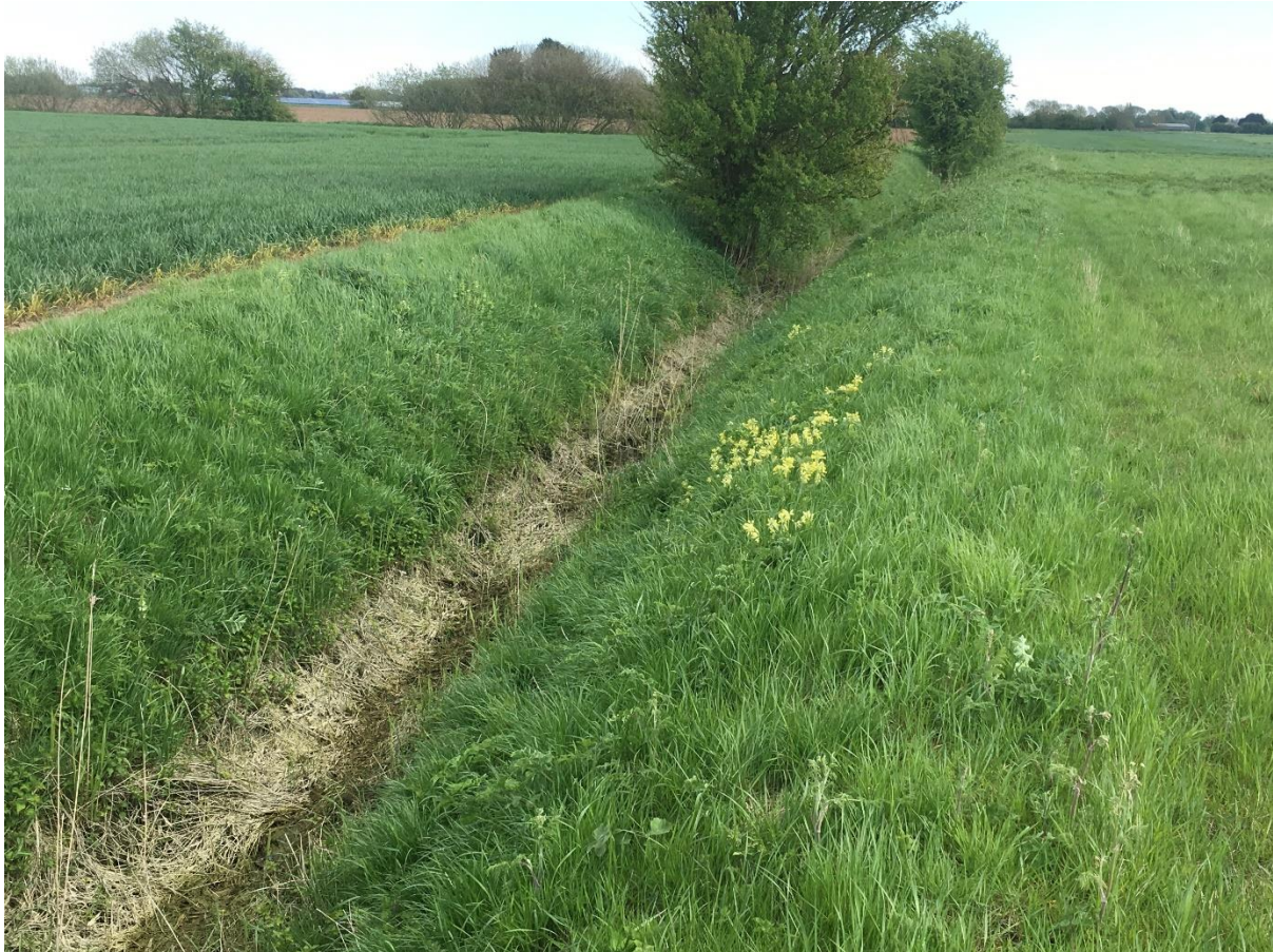
Relict old-grassland species on a ditch bank protected from herbicide and fertilisers: Cowslip ( Primula veris ) near Kirton End

use of chalk for the embankments of irrigation reservoirs nearby but within the Fenland proper provides opportunities for calcicolous grassland plants like Hairy Rock-cress ( Arabis hirsuta ). Rougher clay banks on the edge of the peat fens can also produce surprises such as Giant Horsetail ( Equisetum telmateia ) on the Fenland edge near Ramsey Forty Foot.