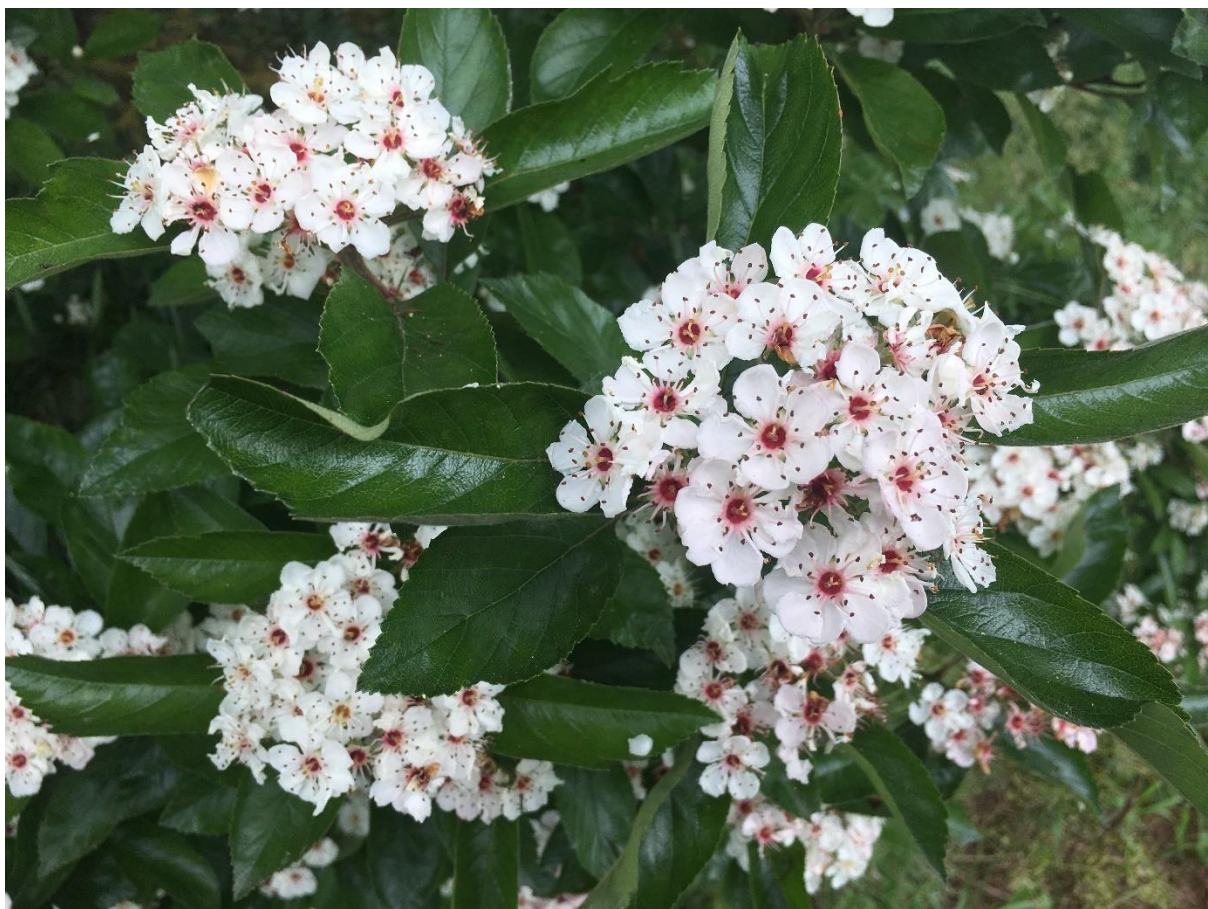
Crataegus crus-galli var. inermis on a rural roadside in Holbeach Fen

in hedges and plantations owes a great deal to the work of Peter Sell and Gina Murrell, as published in their 5-volume Flora of Great Britain and Ireland (FOGBI) . From these books, we realised that, for example, many of the planted birches in Fenland were not actually Betula pendula , but included species such as B. celtiberica and B. populifolia . Incidentally, FOGBI also demonstrates that there are many more elms ( Ulmus species) in our region than the few listed in other floras, as well as a greater variety of Chenopodium and Polygonum species. The variation in Wood Goldilocks ( Ranunculus auricomus group) revealed by Alan Leslie in FOGBI may well add to the species-list for Fenland, where Goldilocks turns up in shaded churchyards such as at Chatteris. Alan has also shown that some scrubby places in Fenland hold a much greater range of brambles ( Rubus species) than does the open farmland, for example finding four different species in the Gildenburgh and Lattersey part of Whittlesey. In conclusion, wooded, scrub and hedge habitats in Fenland are often a blend of the native and the exotic, sometimes with very unexpected species such as Populus simonii in the A16 shrubbery near Spalding and the Medlar ( Mespilus germanica ) and Euonymus sieboldianus along the old railway south of Chatteris found by Jonathan Shanklin and CFG on a wet October day.