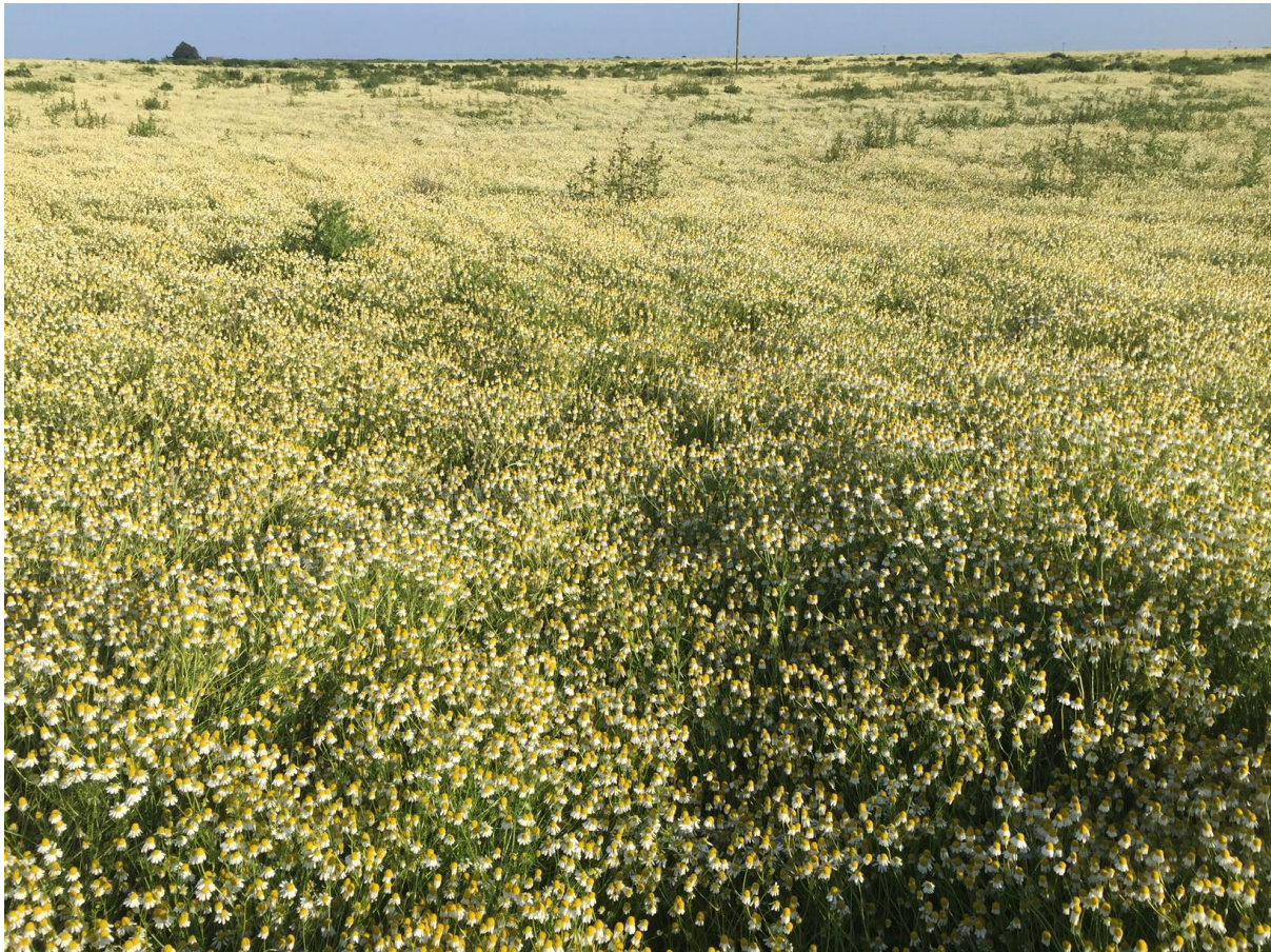
Scented Mayweed ( Matricaria chamomilla ) dominating a fallow field between March and Chatteris

record is thought to be non-native and our own sighting is 30 km north of the closest known native record and hence may also be an introduction. Our walk also took in flooded pits with striking carpets of Pond Water-crowfoot ( Ranunculus peltatus ) in a form without floating leaves and parts of the Gravel Drain, which eventually feeds into the renowned Counter Drain. Here we certainly identified the uncommon stonewort Tolypella glomerata , and may also have found T. prolifera (to be confirmed) which would make this a very important ditch.