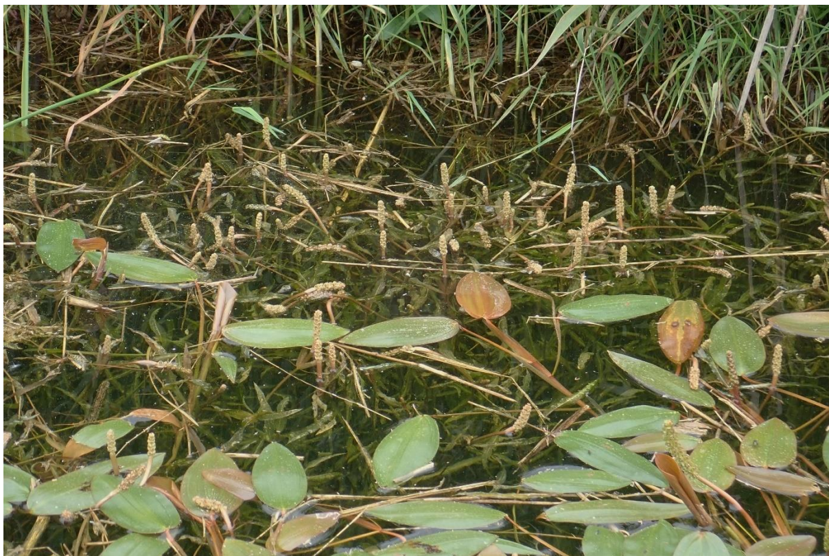
Various-leaved Pondweed ( Potamogeton gramineus ) on Pidley Fen

verticillatum ), Flat-stalked Pondweed ( Potamogeton friesii ), Hair-like Pondweed ( P. trichoides ) and, at the edge of main drains and rivers, Frog-bit ( Hydrocharis morsus-ranae ). Much less widespread, but locally common is the Opposite-leaved Pondweed ( Groenlandia densa ) where we again found new sites in the area north of Peterborough, such as near Newborough. Possibly the most heartening aspect of the survey of drainage channels is the discovery of plants that require low nutrient levels – species that have generally declined due to sewage and fertiliser runoff into ditches. Thus, Needle Spike-rush ( Eleocharis acicularis ) was found at sites at Wimblington Common, in a soak dyke by the Witham near Kirkstead Abbey and Dunston Bankside Drain. During summer 2018 Jon made a detailed study of ditches and associated habitats in the arable fen between Somersham, Chatteris and Ramsey, finding good populations of Lesser Water-plantain ( Baldellia ranunculoides ), Floating Club-rush ( Eleogiton fluitans ) and numerous pondweeds, including Various-leaved Pondweed ( Potamogeton gramineus ). The Soft Hornwort ( Ceratophyllum submersum ) is only rarely a channel species, as in the brackish ditches between King's Lynn and Hunstanton. Almost all our records are for pools and, in 2018, as well as the mere at Woodwalton Fen, we found a new site in pond within a woodland fragment near Holbeach St Mark's.