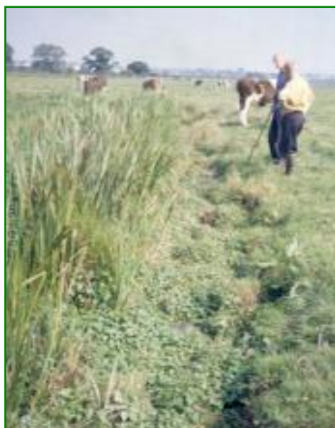
2. Ditch choked with Floating pennywort