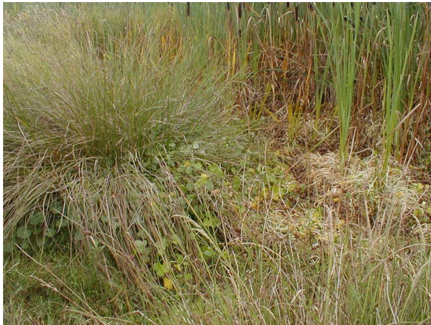
11. Swamp area after spraying 2005 showing sprayed and unsprayed plants

The density of the Typha and reed stems made access to the area difficult and it was impossible to hand-pull the Floating pennywort stems as they often broke off leaving root fragments behind. It was then difficult to dig these out due to the mat of other roots. Spot-spraying with 2-4D Amine during 2005 had some effect in reducing the amount of Floating pennywort present but it soon regrew.