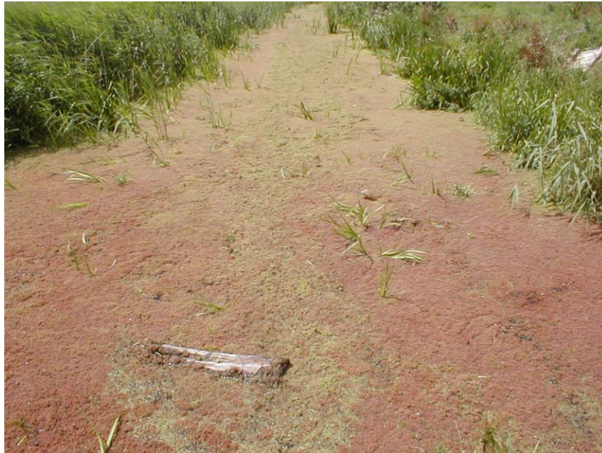
16. Azolla -choked ditch June 2007

This ditch was completely covered with Azolla during 2007 but with no treatment was clear in 2008 and just occasional plants have been seen since. Azolla does not appear to be a persistent problem here.