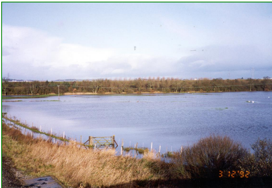
10. Winter flood