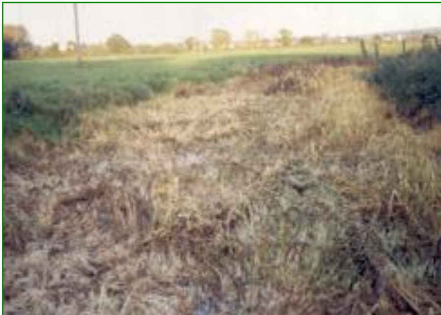
4. Ditch with sprayed Floating pennywort