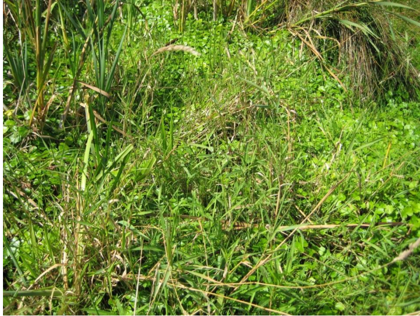
12. Plants in the swamp area before spraying in September 2007

In September 2007 transects were walked over the whole of the low-lying field and Floating pennywort was only found in the swamp area. This was sprayed with 2-4D Amine with the addition of 'Top Film' adjuvant. The untreated, clearly marked walkways through the stand were sprayed a week later, giving a total treatment with no overspray, which effectively reduced the biomass present. Only a few small plants with small leaves were located in December on the edges of the swamp area.