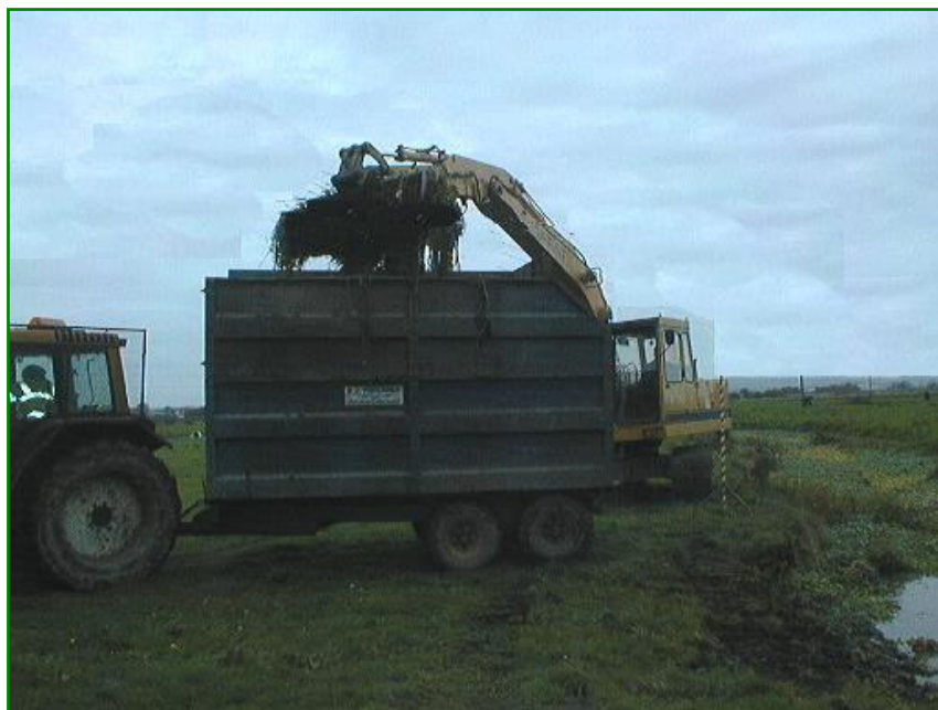
7. Loading into silage trailers prior to removal to compost site