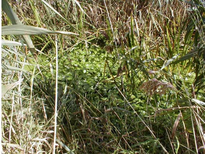
15. Plants in Black Gulf

Black Gulf held persistent patches of Floating pennywort until 2010. It was a difficult ditch to survey and remove plants from due to the dense 2m tall fringe of reeds, which both obscured a view into the ditch from the bank and obstructed progress along the ditch in the water.