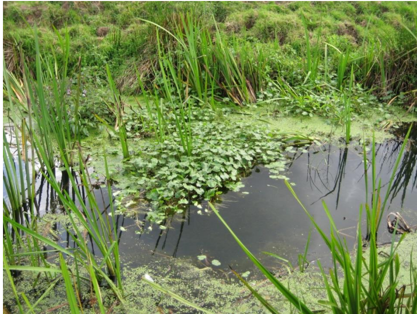
9. Plants starting to grow across a ditch in late May

It appeared that Floating pennywort starts growing in May with an increase in leaf size and the plant starts to grow across the ditches. After the first one or two removals the plant abundance decreases in June and July before another growth spurt in August/September, as shown in Graph 1.