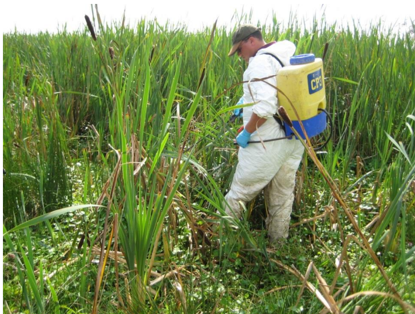
13. Spraying in the swamp area September 2007

In September 2007 transects were walked over the whole of the low-lying field and Floating pennywort was only found in the swamp area. This was sprayed with 2-4D Amine with the addition of 'Top Film' adjuvant. The untreated, clearly marked walkways through the stand were sprayed a week later, giving a total treatment with no overspray, which effectively reduced the biomass present. Only a few small plants with small leaves were located in December on the edges of the swamp area.