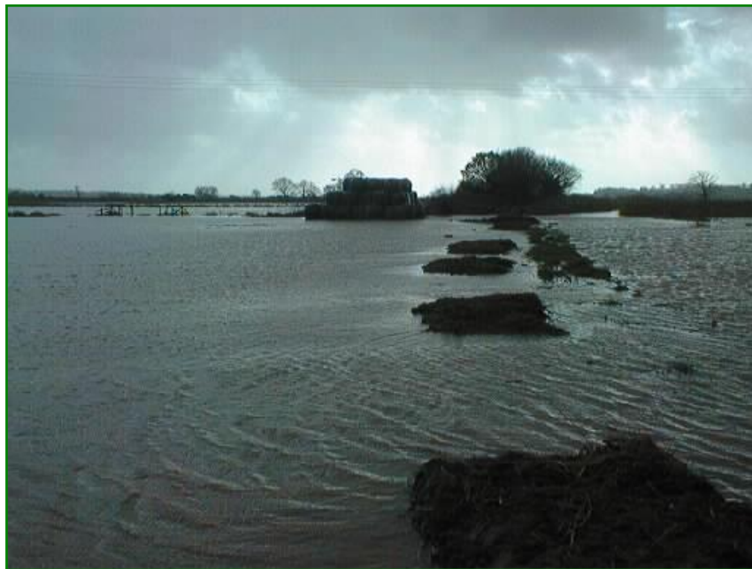
5. Flooding spreading fragments of Floating pennywort downstream

Serious flooding across Devon during 2001 resulted in a backlog of flood defence work, restrictions due to the Foot and Mouth outbreak meant all EA operations were halted. The control programme was delayed but some removal took place during the routine maintenance.