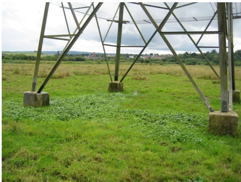
14. Plants under pylon July 2008

No Floating pennywort had been recorded here until July 2008, and spraying during September 2008 was followed up with root-digging. The last plants were dug out in December 2009 and none have been seen since. The area beneath the pylon is poached by cattle and often holds water during the winter months. It is some 3-5m from the nearest ditch and was dry throughout the growing period in 2010.