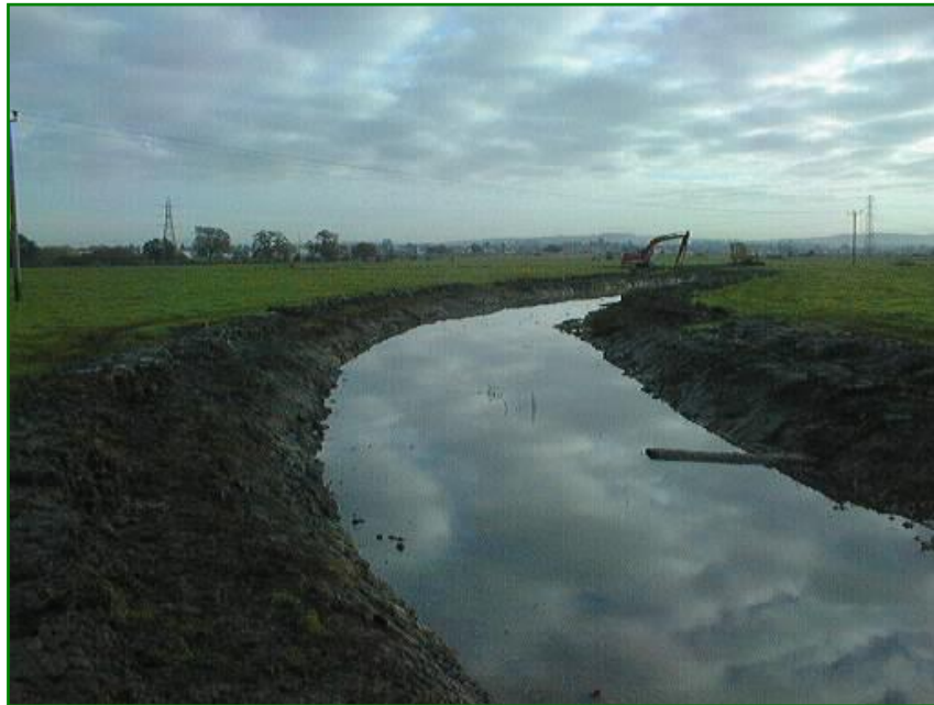
8. Digger removing marginal plants and widening ditch

The next stage was to remove the marginal plants which were rooted into the bank. These dredgings contained too much silt to be accepted for composting and it was too expensive to take to landfill (£30 per linear metre), therefore the plants were buried on site. The dredging resulted in widening of the ditches. Whilst dredging had an initial impact in removing the main mass of the weed many roots and fragments were left behind and these regrew.