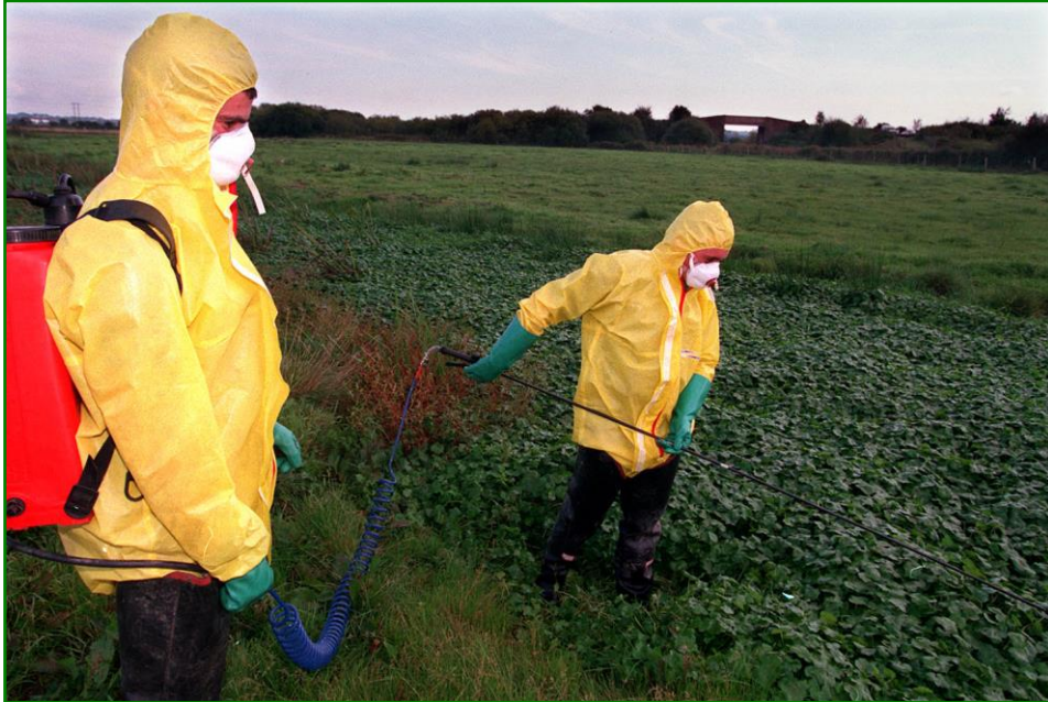
3. Spraying with Reglone

After Floating pennywort was discovered in September 1999 it was felt that mechanical control would be too disruptive and damaging for the ditch flora and fauna so while the problem was still confined to 6 ditches EA sprayed Diquat as Reglone. Although this was initially effective the plant soon recovered and continued to spread.