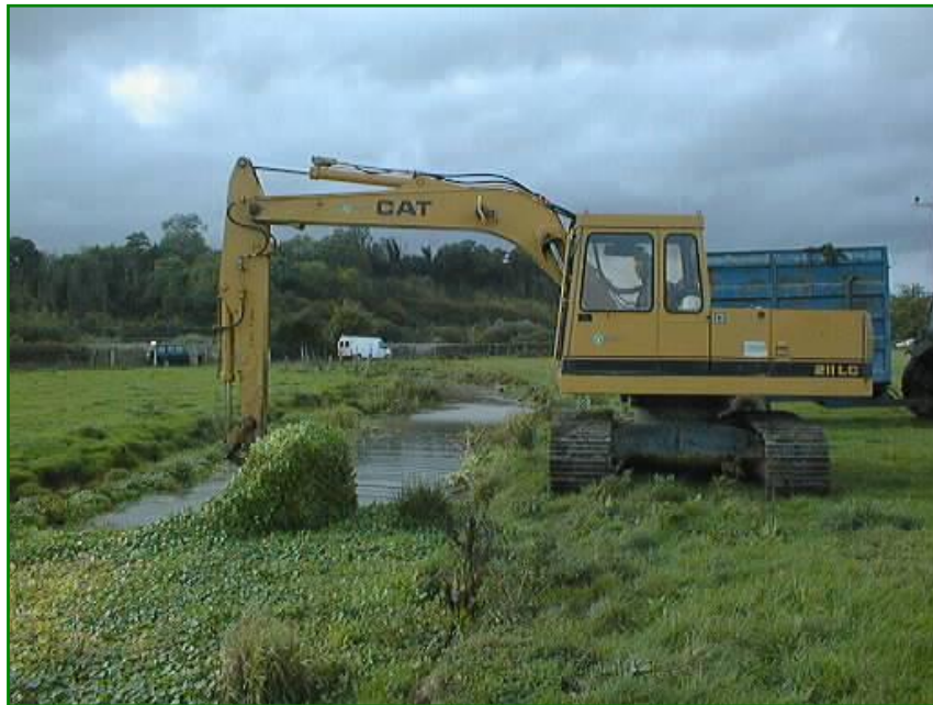
6. Removal of floating mat

In 2002 the removal programme was re-started with the floating carpets dredged by diggers, loaded into silage trailers, allowed to drain and then removed to a compost site.