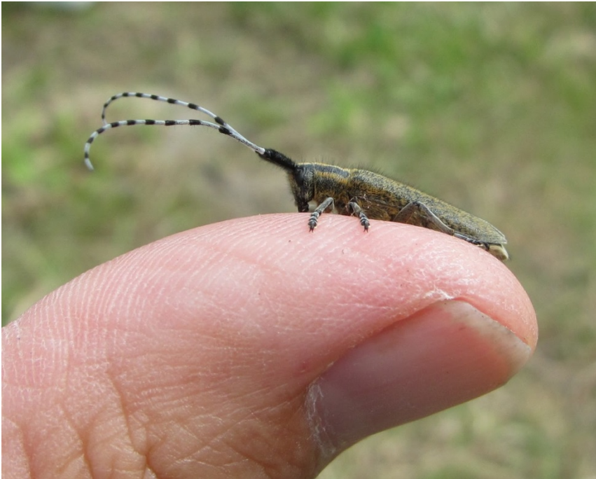
Golden-bloomed Grey Longhorn beetle, Agapanthia villosoviridescens .

Thank you to all the experts who came and shared their knowledge, and to everyone who came along to have a good time too exploring the wildlife in their local patch.