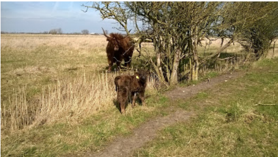
Highland cow Gale, with the first calf born in 2016 at Wicken, on Baker's Fen. This male was named Winfred , after Sir Norman Winfrid Moore, who had been associated with Wicken Fen for many years.

There is an ongoing cycle of replacing the fencing across the land as well as control of vegetation alongside the key paths and access routes. This is a considerable amount of work, as there are many kilometres of fences and 45 km of paths across the nature reserve.