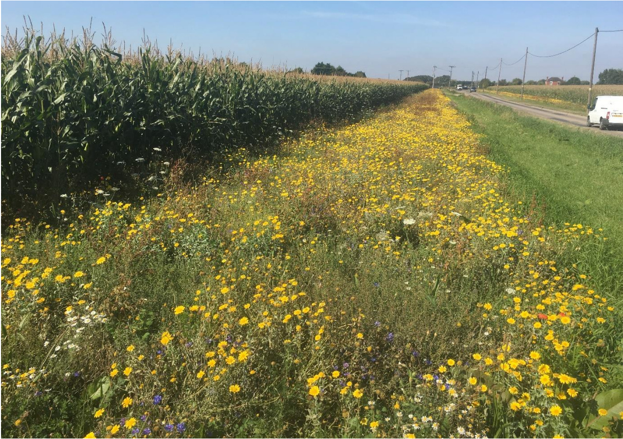
Wildflower strip by maize: Staples at Wrangle September 2019