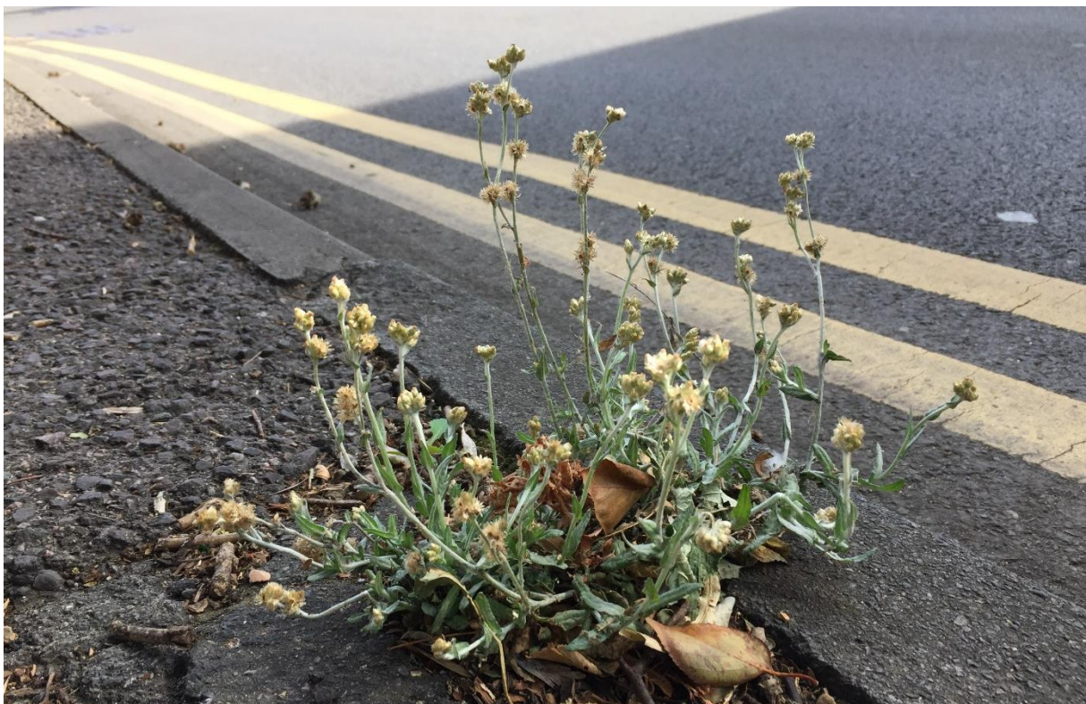
Jersey Cudweed ( Laphangium luteoalbum) at Chapel Road Wisbech