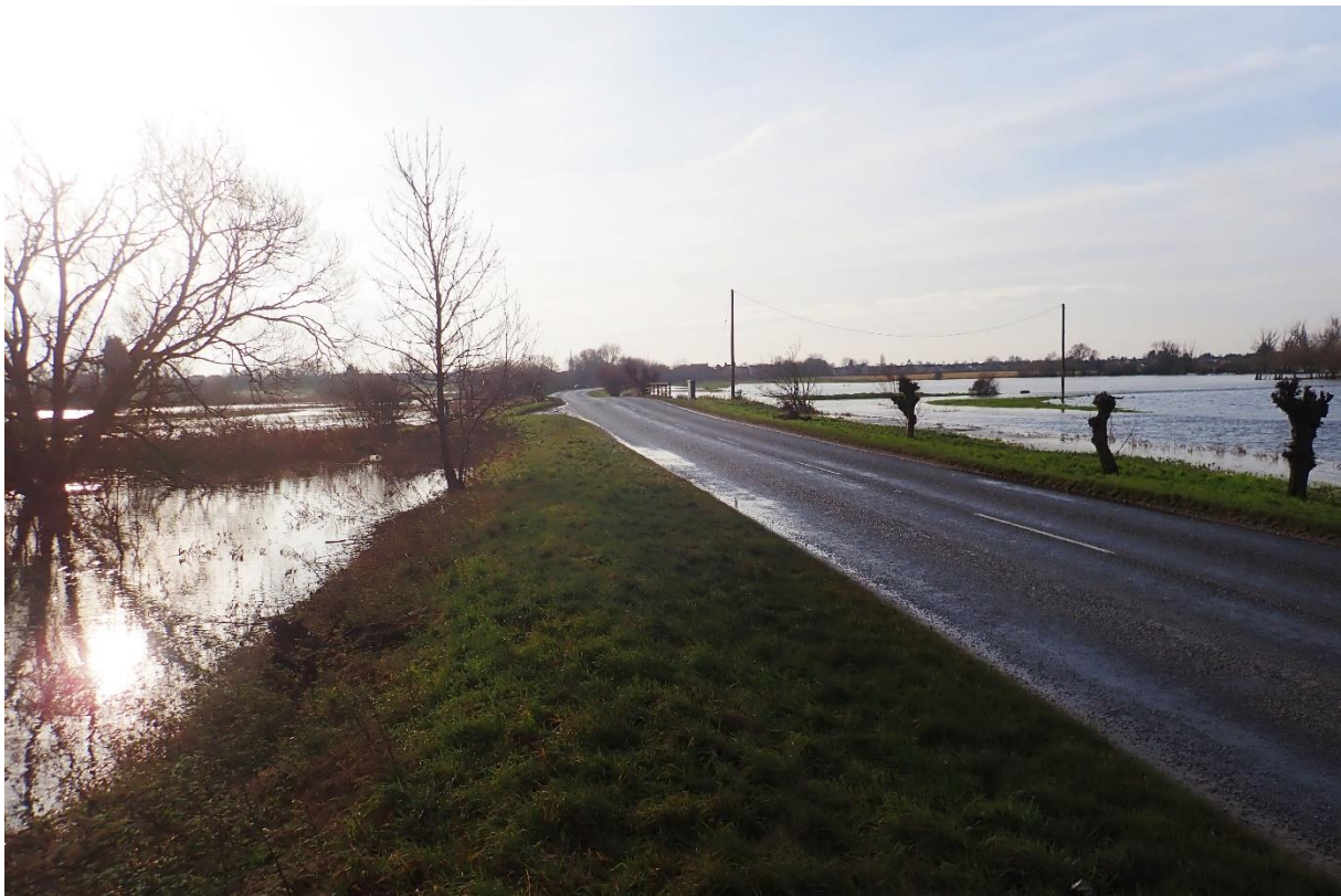
The “home” of the Fenland Flora – looking toward Whittlesey over the flooded Nene Washes in December 2019 at the end of the main field campaign