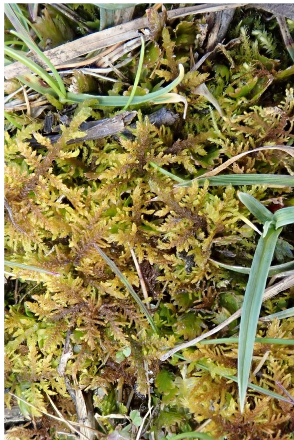
(Left) Lophocolea semiteres (Stanground Wash), (right) Thuidium assimile (Bassenhally Pit)