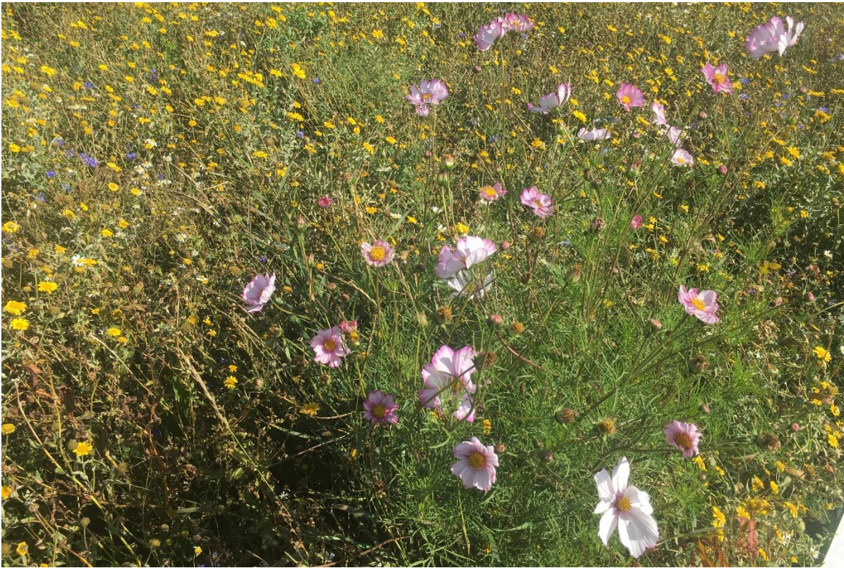
Cosmos bipinnatus in a wild flower strip: Staples at Wrangle September 2019